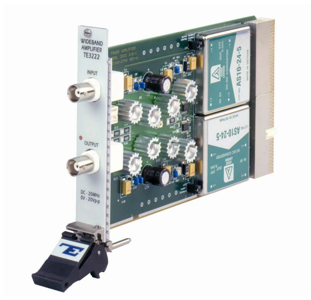
Figure 1-1, TE3222